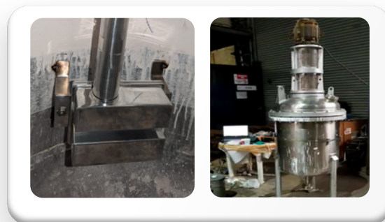
Fixture inside the tank and Overall System setup in Schneider Electric